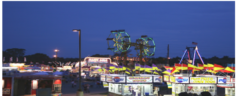
73 Dick W8KDR