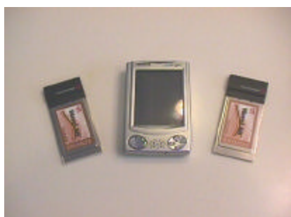
PDA & PCMCIA Wireless Cards