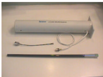
Gain Antenna Used For HSMM