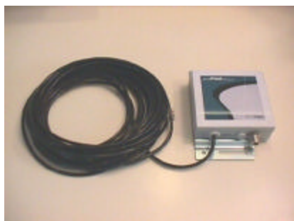
Typical 802.11 Wireless Bridge