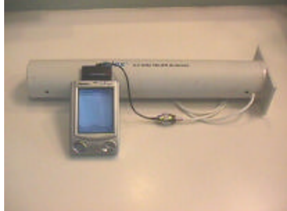
PDA & Yagi Test Unit