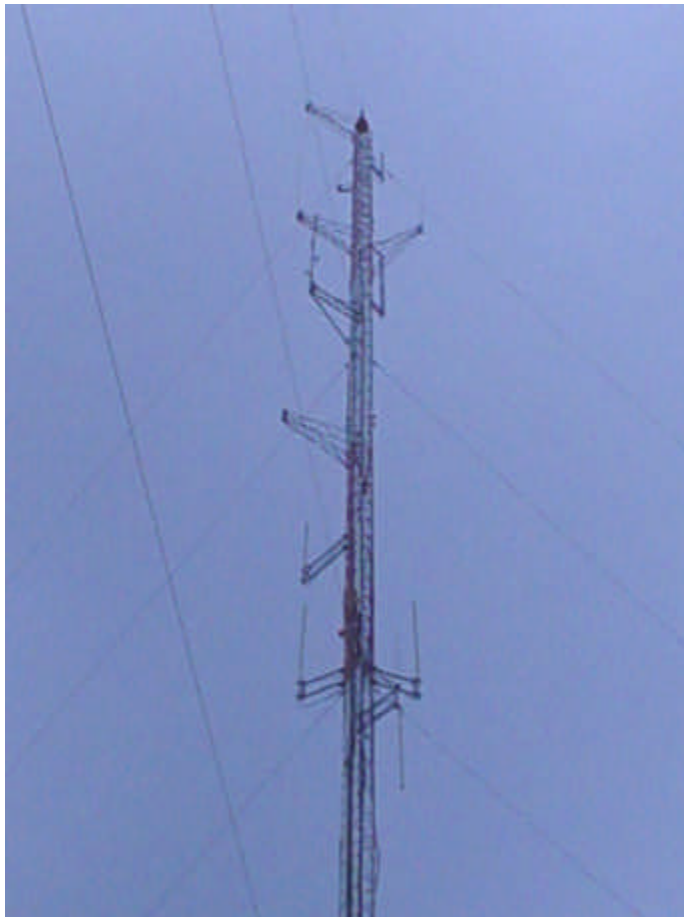
I Wonder Where This Is.

So here is how simple it is. Call, Email, Postal Service, or yes pick up the mike and call me. KC8QQN. Let me know where you want to be in making Operation care Labor Day 2004 a BIGGER success than Operation Care Memorial Day was.