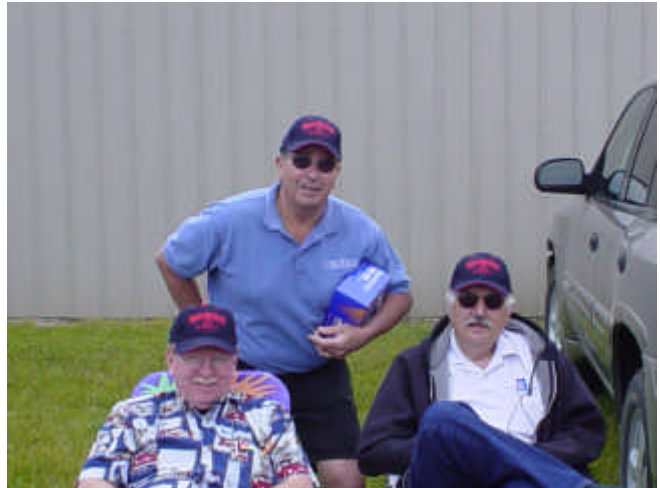
Random Shots From The Chelsea Swap....