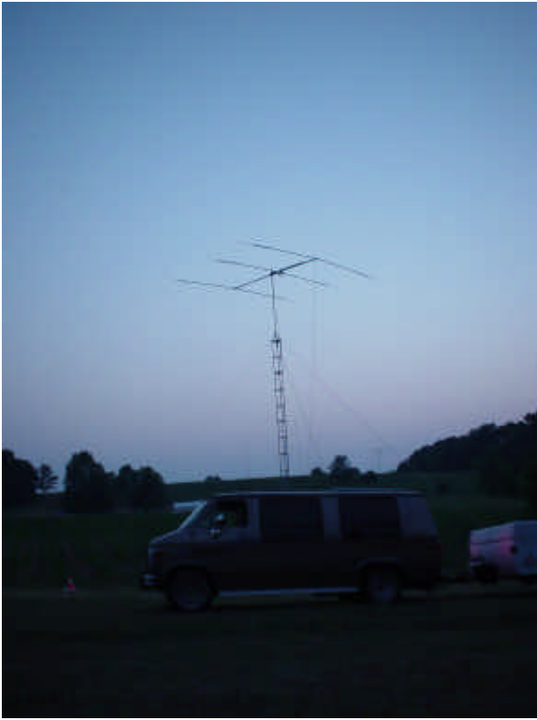
Field Day Beam In The Air