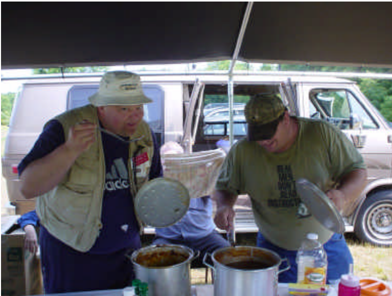
Some JBA Members Eating All The Food