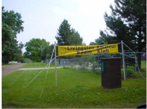
LARK Sign On The Road