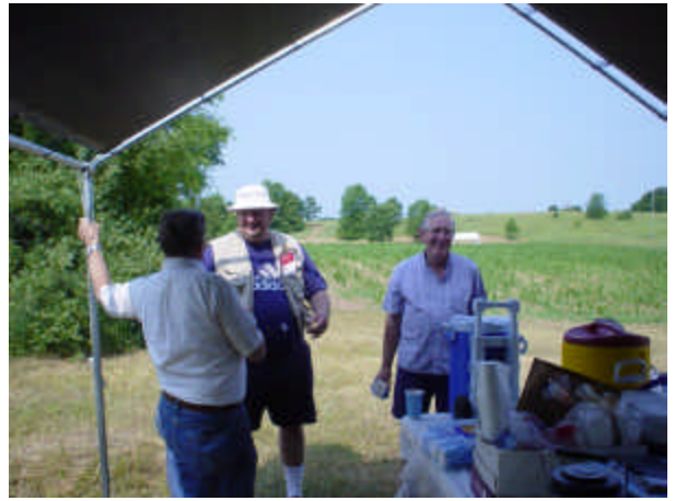
Happy, Well Fed Operators.....