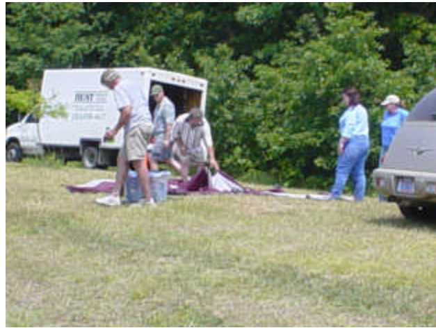
Tearing Down After A Fun Weekend