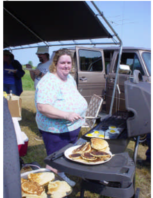
Our Cook This Year