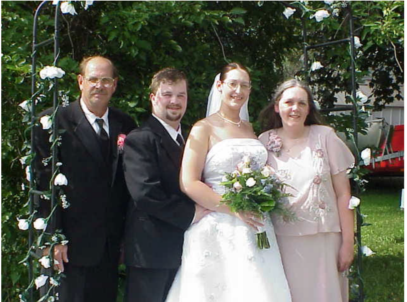
DOES THIS MEAN LESS TIME FOR RADIO FOR KC8RVR?

As if some unseen force guided her, she grabbed the manila enveloped to get the grizzled ham's address, but this only shocked her more after she opened the envelope. She sat back down in her chair to clear her mind... For both the crystal and information about it and the old grizzled ham, had vanished.